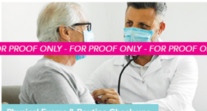
Physical Exams & Routine Check-ups