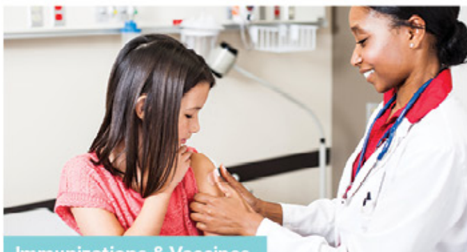
Immunizations & Vaccines