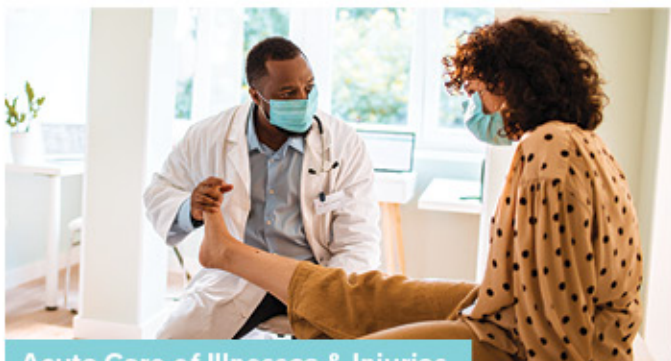
Acute Care of Illnesses & Injuries